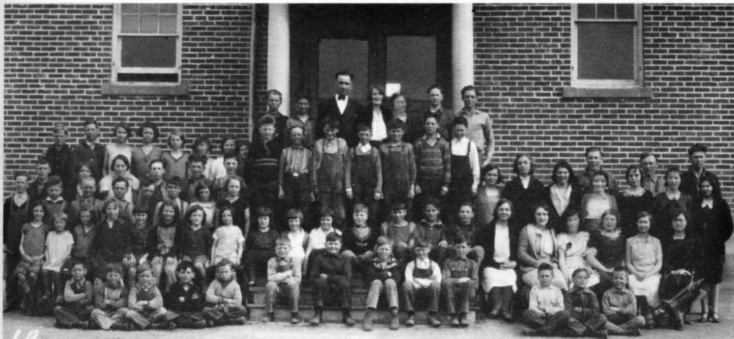
Invermay Public School 1931.